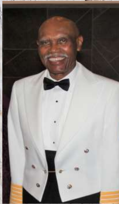
By Pastor Owen Alston

2 The people who walked in darkness have seen a great light; those who dwelt in the land of the shadow of death, upon them a light has shined.